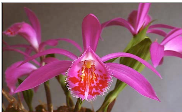
Pleione Tongariro. Exquisite!

Bulbils are tiny plantlets, which form at the apex of the bulbs in the fall and look like skinny tiny green onions with a small "hook" on the top of the leaf. This hook acts like a burr so be careful that the hooked bulbils do not stick to the dead leaves when you are removing them. You can collect the tiny bulbils, store them in paper bags, and plant them out in containers (separately from mature bulbs) in the spring with the bulb end down but not covered by earth. In two to three years, you will have mature plants from your bulbils.