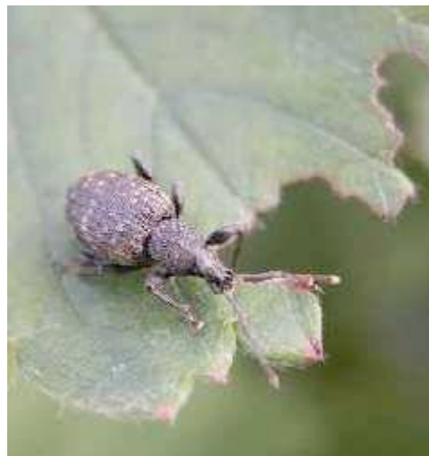
Root Vine Weevil