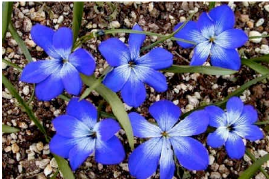
Tecophilaea cyanocrocus – how beautiful is that!