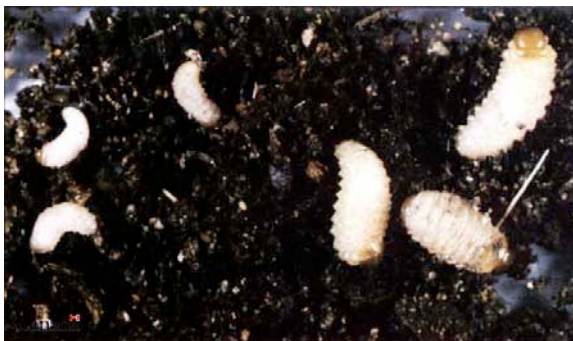
Root Vine Weevil larvae