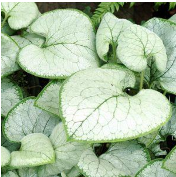
Brunnera 'Looking Glass'

As you can see, Brunnera are valuable additions to any shade garden and with new cultivars appearing each year their usefulness is only going to increase.