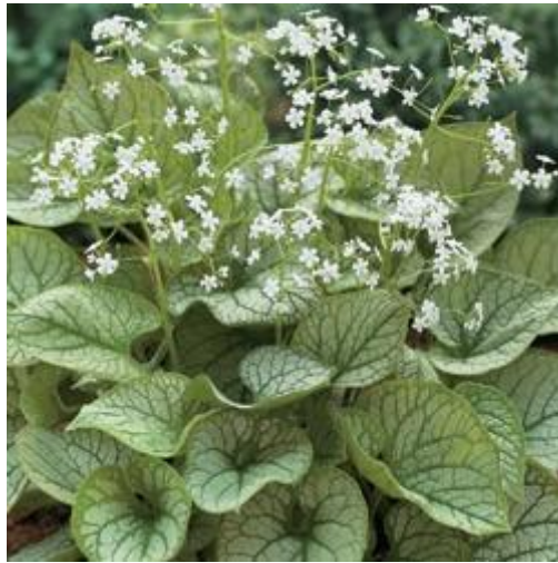
Brunnera 'Mr. Morse'