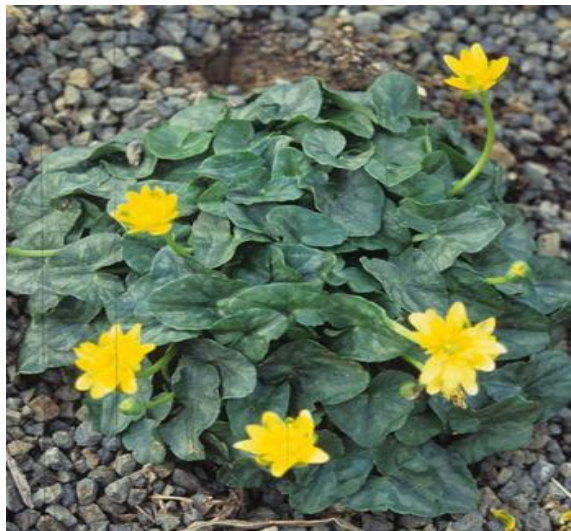
Ranunculus ficaria 'Yaffle'